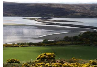
04. Kyle of Tongue landscape