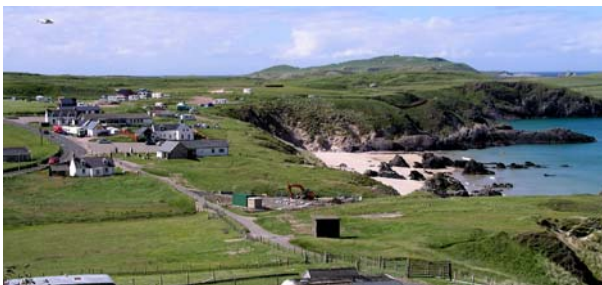
03. Durness village and coastline