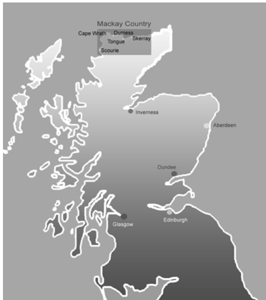
01. Map of Scotland